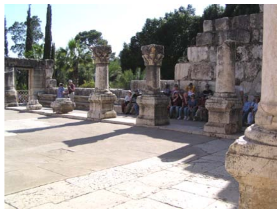
Ancient Synagogue at Capernaum