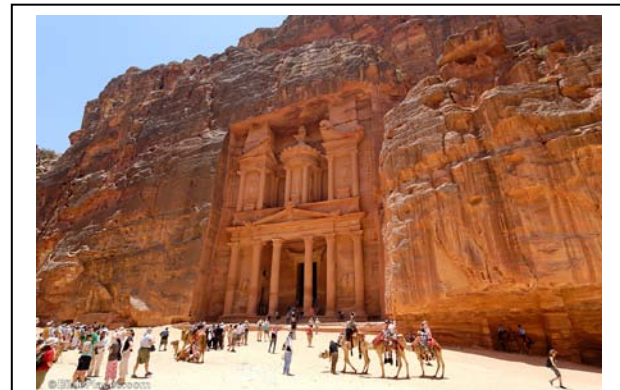
The Treasury (Kazneh) at Petra