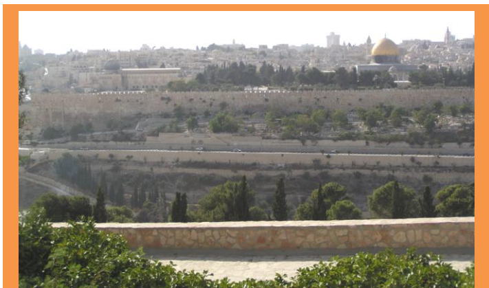
Today's view of the Temple Mount from near where Jesus wept over Jerusalem - Today called Dominus Flevit, meaning "the cry of the Lord" or "The Lord wept."