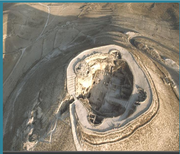
Herodium - the location of the tomb of Herod the Great

The Herodium is located about 8 miles south of Jerusalem, and 3 miles from Bethlehem. It is believed to have been a combined palace/fortress.