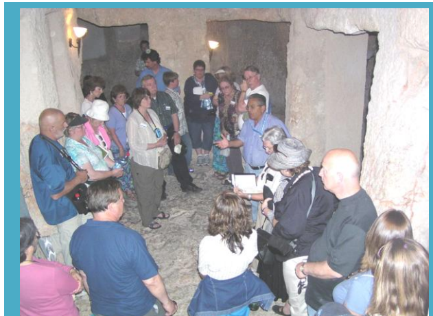
The dungeon in what is believed to have been the house of Caiaphas, the High Priest. This is the view from inside the dungeon where Christ spent the night before His crucifixion. In the first century, the only entrance to the dungeon was through a round hole through the stone ceiling.