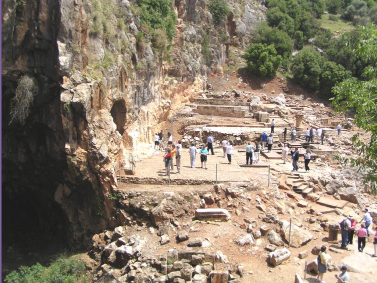
Caesarea Philippi - the most northerly place recorded in the Bible where Jesus and the Disciples went.