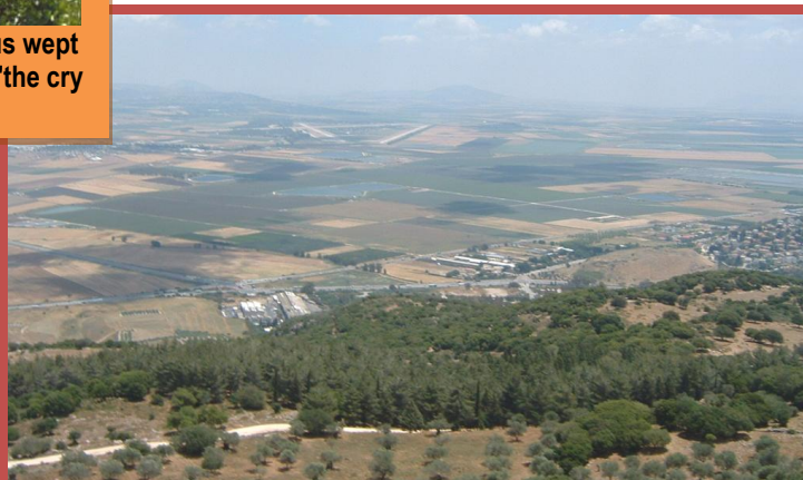
Valley of Megiddo as seen from the Carmel Mountain Range. Also known in Scripture as the Jezreel Valley and the Valley of Esdraelon.