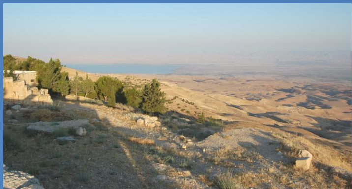
Westward view of the Promised Land from Mount Nebo Moses dies here because God did not allow him to enter.